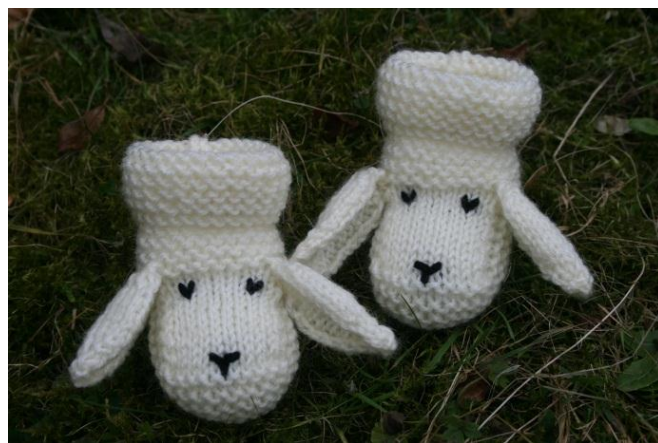
Photograph shows booties made up in first size