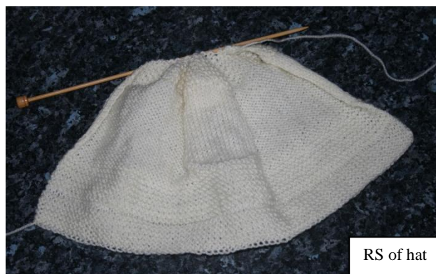
RS of hat

(A total 60[66:72] rows have been worked)