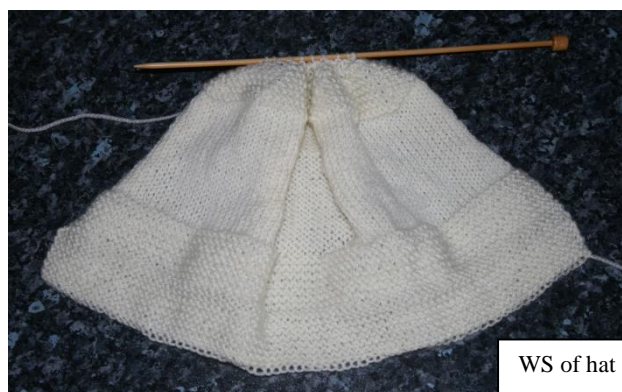
WS of hat