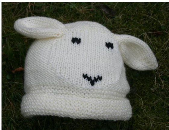
Photograph shows hat made up in first size

Using 4mm/US 6 needles and MC, cast on 81[91:101]sts.