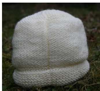
Back view of hat